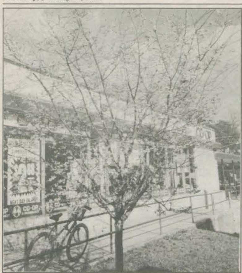
This flowering Cherry tree is blooming now near the Co-op supermarket.