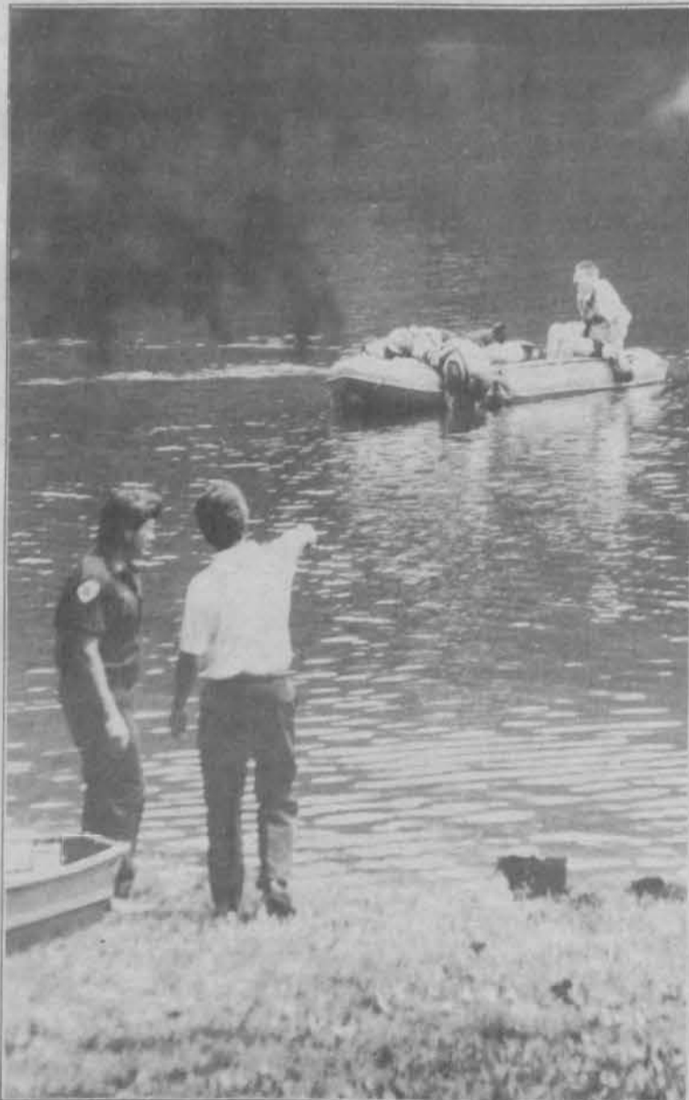
Police and fire officials see the shoreline and area for drowning victim.