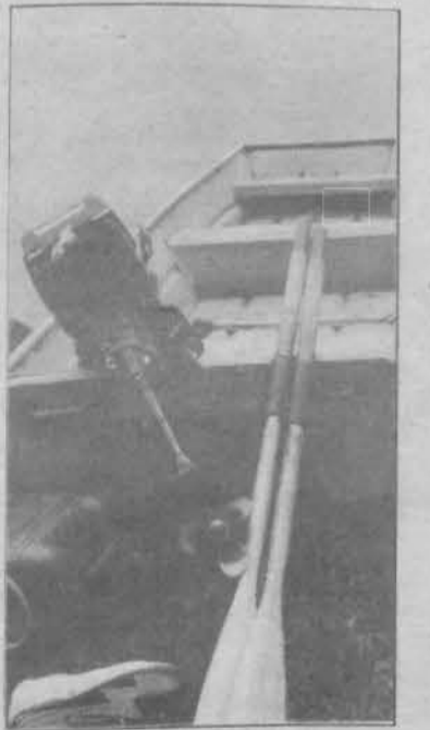
The 12-foot jonboat with a 7.5 h.p. motor.