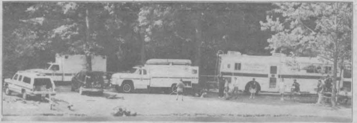
More than 80 rescue personnel with a variety of Greenbelt Lake Monday and Tuesday. Vehicles, rafts, divers and dogs converged on

The wording of the city's lease with the concessionaire, which dates from the 1960s, states that the boats must be equipped with "approved life preservers, which may be in the form of approved buoyant cushions. In addition, every child and upon request, any other person in a rented boat, shall be furnished a life preserver vest." All holders of the concession lease have also agreed to obtain necessary licensing from the county and state and to abide by the terms of those licenses.