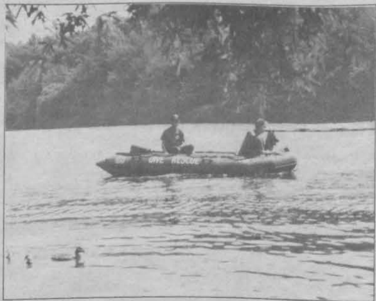
Dogs were brought in to help in locating the spot in the water where the boat turned over.