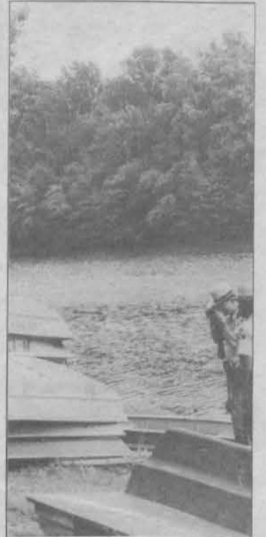
The Maryland Department of Natural Resources Police have jurisdiction in this case. Here they are gathering information about the boat.

ing lot a second time at 1 p.m., a Greenbelt Fire Engine raced out with its siren on. I thought perhaps the body had been found, but the truck was apparently responding to another call. At the lake little had changed. Two Natural Resources policemen were slowly traveling the lake in a motor boat, dragging a chain. Another boat, an inflatable, contained a diver who dove and surfaced repeatedly without finding anything. The Channel 9 news van had departed and was replaced with one from Channel 7. The Prince George's County Fire Department had set up its Emergency command Center vehicle on the far side of the lake, where fireworks had been set off only a few days ago. Boats and rescuers were now centered there instead of near the concession stand. The dedicated professional men and women continued to search and discuss what to do next, but it was a somber group.