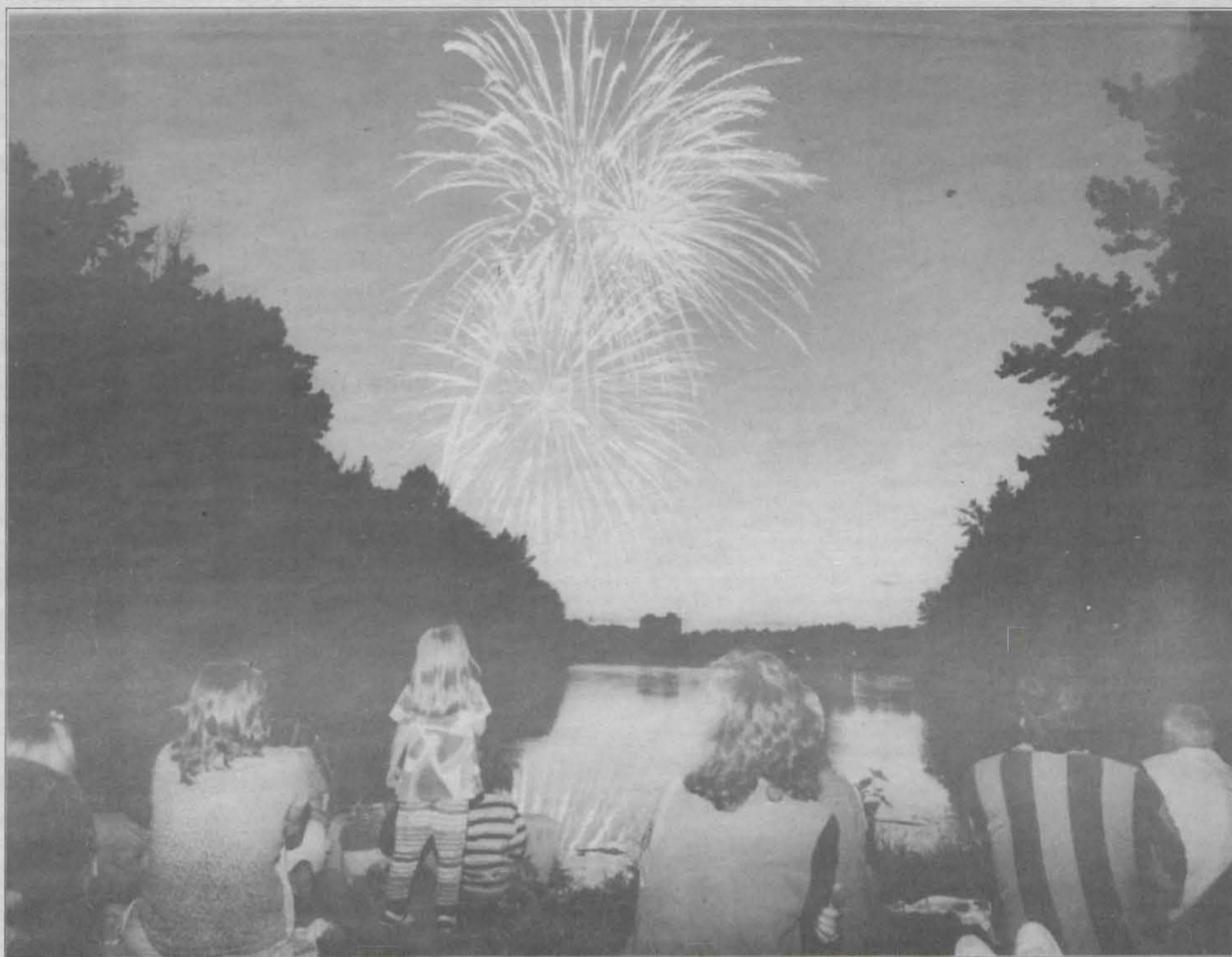
Greenbelters, young and old, enjoy the spectacular display.