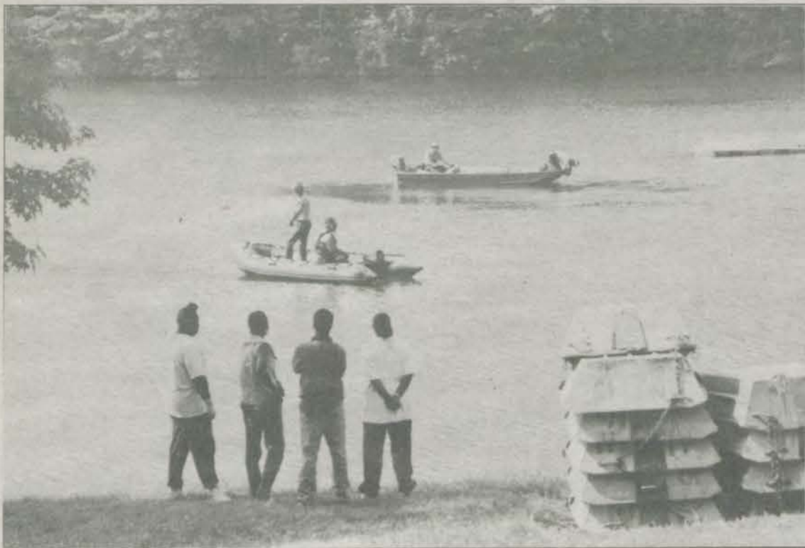
Friends and family of the drowning victim hold a long vigil at Greenbelt Lake, watching and waiting as the search continues.

Our office is located in the Greenbelt Community Center. Use the entrance facing the Municipal Building, go up the inside steps to the first door on the left (Room 100).