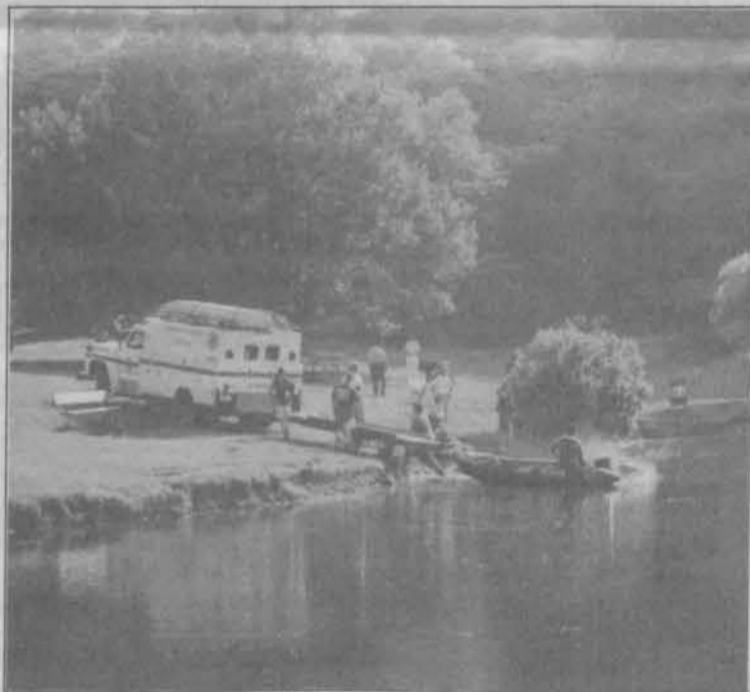
Dive boat is lowered into Greenbelt Lake to resume the search on Tuesday, July 9.