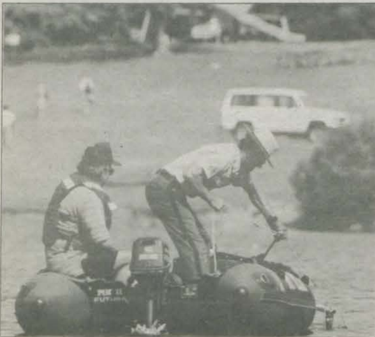
State and county agencies have been searching the bottom of the lake with every means available.