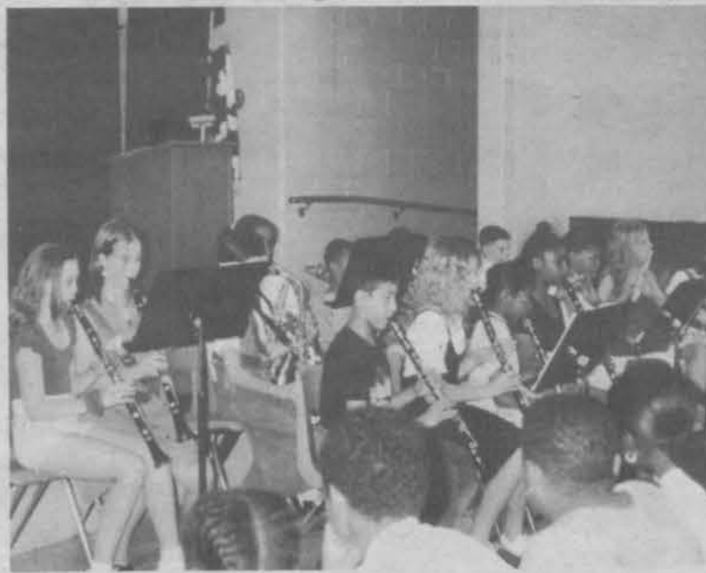
Greenbelt Elementary School musicians played at the Honor Roll Assemblies on June 10.