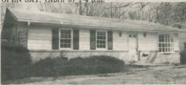
236 Lastner Lane

BOXWOOD VILLAGE - Walk to Greenbelt Lake from this GRAND RAMBLER with 4 Bdrms & 3 full Baths. Country Kit - Formal Din Rm - Professionally painted -Newer Furnace - Rec Rm with F.P. Walk-out basement ESTATE SALE - for more info call Tricia 506-8547. OPEN SAT. (April 8) 1-4 p.m.