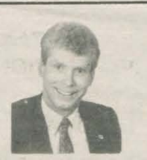
Tax Preparation Reasonable Rates

LYNN FERGUSON, 1978-1995 - Until we meet again I will always carry the pain of your loss but with it a memory of your kindness and a picture of your smile. WDF I love you.