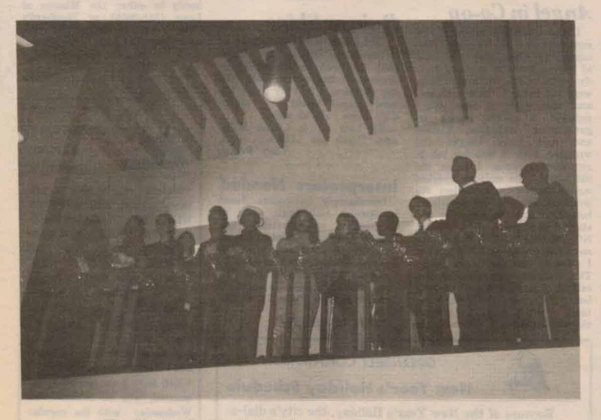
The Eleanor Roosevelt High School Chamber Choir sings for the tree lighting ceremony at Greenbriar on Sunday, December 11.