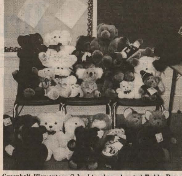
Greenbelt Elementary School teachers donated Teddy Bears for homeless children in a campaign sponsored by the Commission for Children and Youth.

I was shopping in the Co-op supermarket last Friday, De-cember 23. I was given the duty of buying food for a needy family with three children. They were not going to have a Chirstmas this year; it just wasn't possible. A special person organized a collection. Clothes and toys were bought and wrapped. Now it was my job to get the groceries. I made the list, clipped the coupons, checked money and went to collect the goods needed. At the register I helped to bag the groceries and started to pay the bill . . WHAT, NO MONEY!!! I had lost the money in the store. I had it when I came in and now it was gone. The cashiers were all very concerned. Everyone helped to look, but it was gone. So through my tears I drove home to get my checkbook. When I returned, the