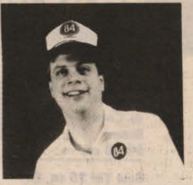
G & O Design Wins Award

Every quarter, the Virginia and P.G. County regions of Weichert, Realtors recognizes the top three sales associates who have the largest production in seven different categories, listings obtained, total sales, listings sold, revenue units, sales volume, number of Open Houses, and first year licencees' production.