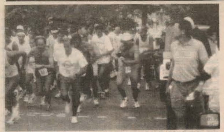
They're off and running at the Labor Day Festival 9.3 kilometer race, the Washington area's oldest running race.