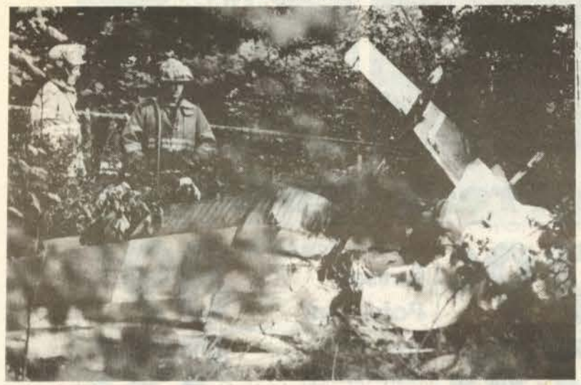
Fire fighters watch somberly as downed plane smolders

The flight and subsequent crash of the small plane in the back yard of a Greenbelt home on September 10 was witnessed by numerous Greenbelt residents. What follows is an account of what some of them observed and felt.