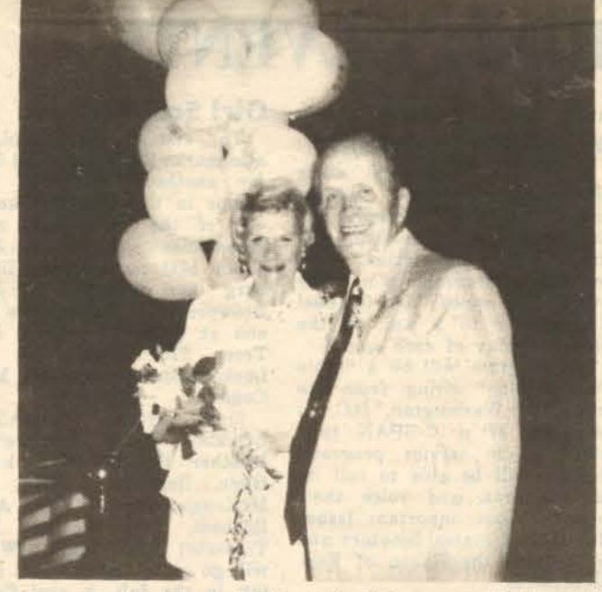
Couple comes to sister city Greenbelt to renew their wedding