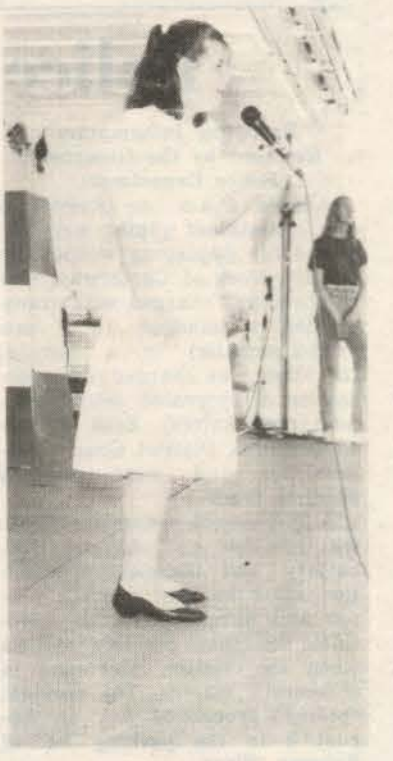
Young talent on stage at a previous Labor Day Festival.

Don't forget! Report back to the statue in Roosevelt Center for the awards ceremony.