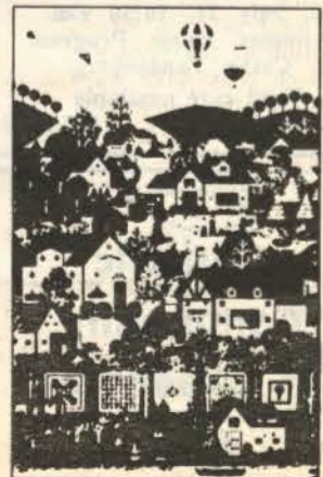
Artists and artworks subject to availability