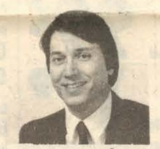
What Is The Dentist's Role In Cancer Detection?

Your dentist is in a unique position, being the one health professional who generally sees you on a regular basis. In this way he can more readily spot certain tell-tale changes in general health or appearance.