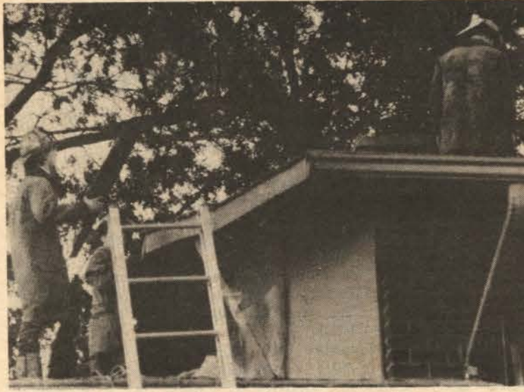
After the fire is over, the cleanup begins.