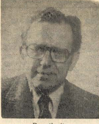
By authority of Candidate