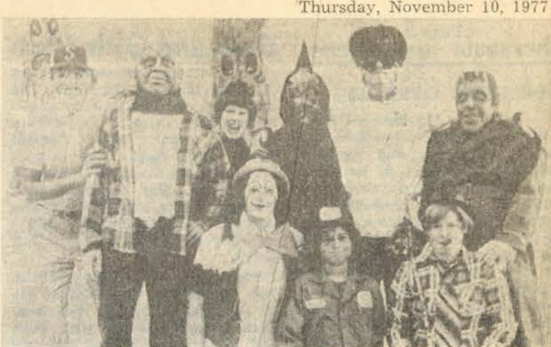
Recreation Department staff spooks it up at the annual Halloween Costume Parade and Party.

Prior to the dedication on Saturday the Washington Capitals will conduct a practice scrimmage from 10 a.m. - 12 p.m. The entire program is open to the public.