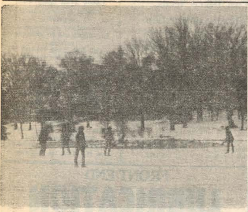
Skaters enjoying Greenbelt Lake