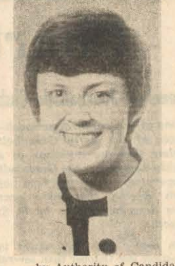
by Authority of Candidate