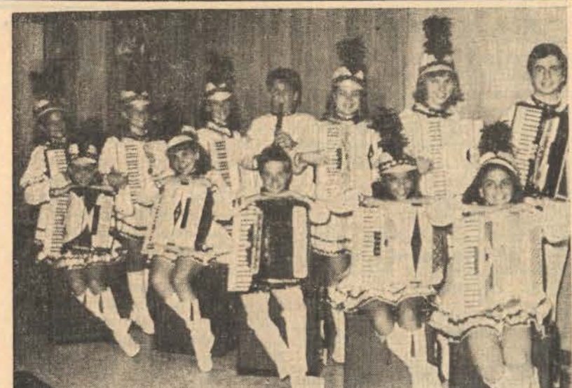
The "Piper and His Pumpers" will play at 3 p.m. on Sunday,