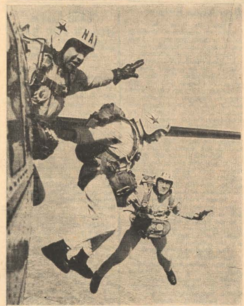
U. S. Navy Chuting Stars forming a "Sky Chain". Greenbelters will be able to see them at 2:30 p.m. on Saturday.