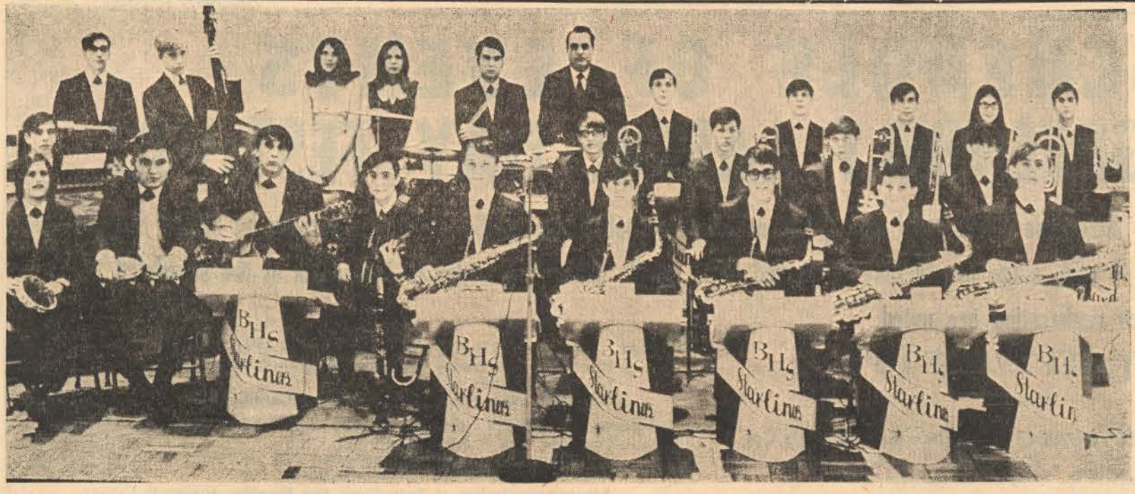
Bowie Senior High School "Starliners" will play at the Mardi Gras Dance at 9 p.m. on Saturday