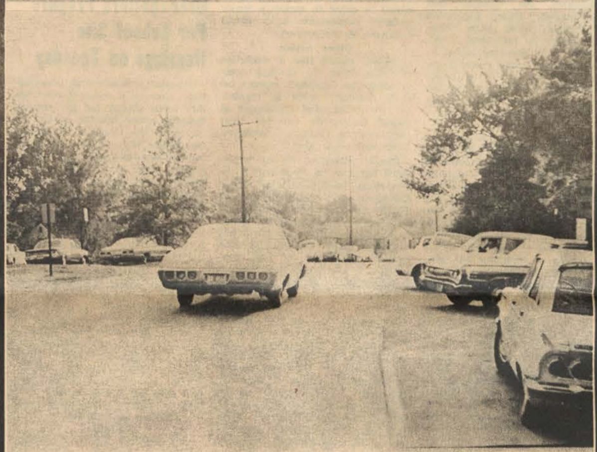
TWO VIEWS OF NARROW RIDGE ROAD, WHICH WOULD BEAR THE BRUNT OF SCHOOL TRAFFIC. Above, Ridge Road near Plateau Place as it approaches Northway, the entrance to the proposed parcel 2 school site. Below is one of the blind spots on Ridge Road caused by a combination of parking court exits and on-street parking.

Space purchased by Greenbelt Homes, Inc.