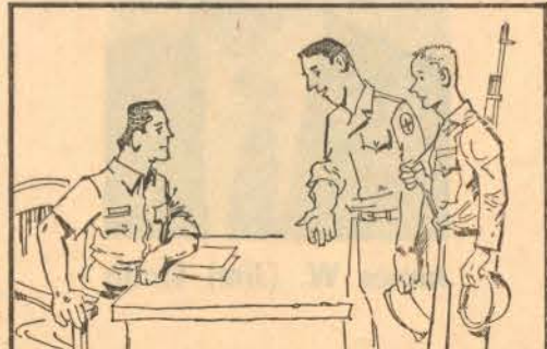
Field director and serviceman go to latter's CO who grants permission for the emergency leave.

Chapter worker gets on the phone to tell the serviceman's Red Cross field director about the case. (A cablegram would be used in the case of a serviceman overseas.)