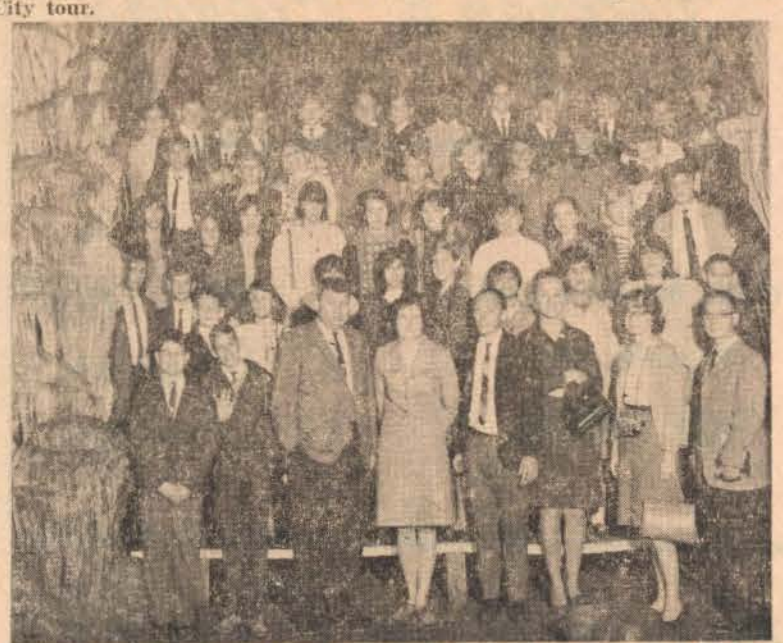
Seventh graders pose in Luray Caverns on trip that also included Monti-