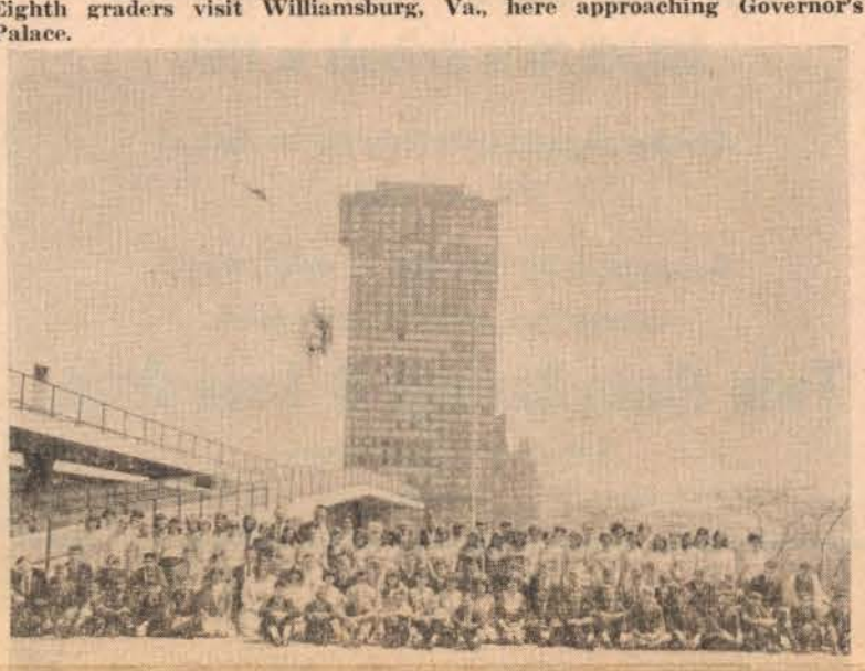
Ninth Grade students in front of United Nations building on New York