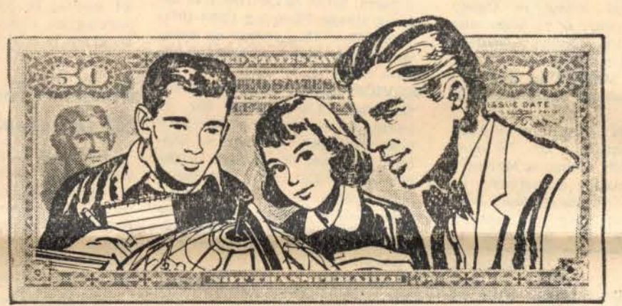
Money to help our children learn how to make peace lasting.

Yes, peace costs money. Money for research and schools and military preparedness. Money saved by you to keep our economy strong