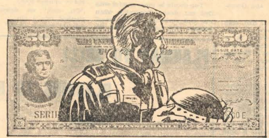
It takes money to keep our jet pilots patrolling the skies. . . .