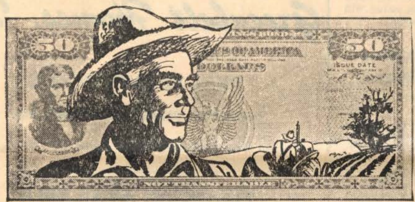
Money to insure that our productive power will thrive. . . .