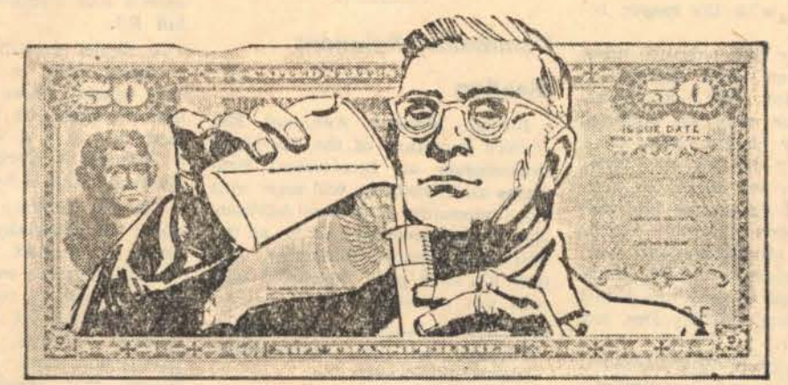
Money to let our scientists continue their search for answers....