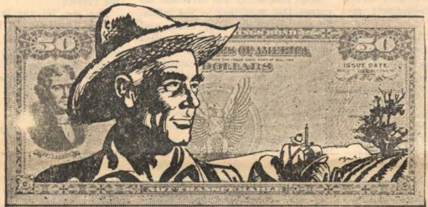
Money to insure that our productive power will thrive. . . .