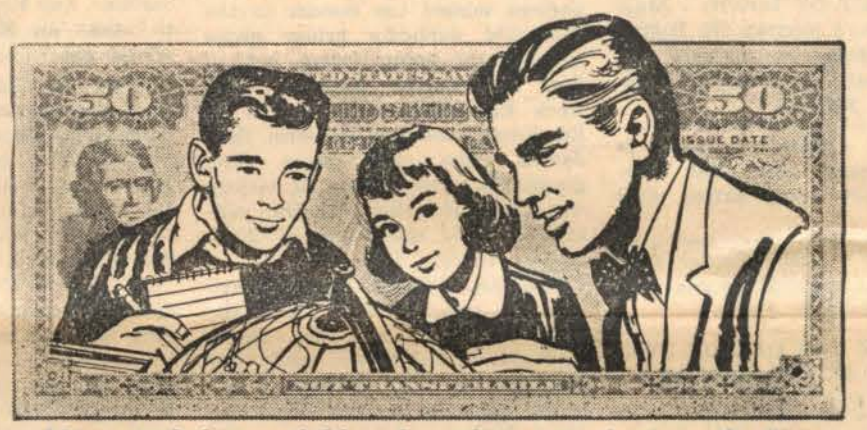
Money to help our children learn how to make peace lasting.

Yes, peace costs money. Money for research and schools and military preparedness. Money saved by you to keep our economy strong