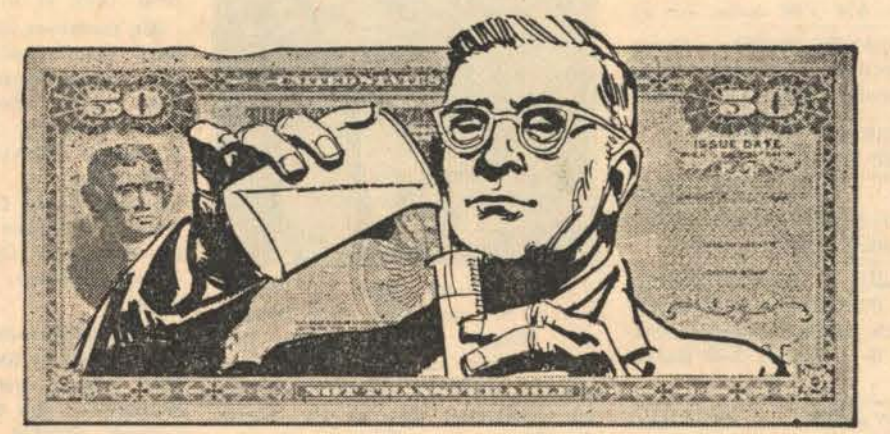
Money to let our scientists continue their search for answers....