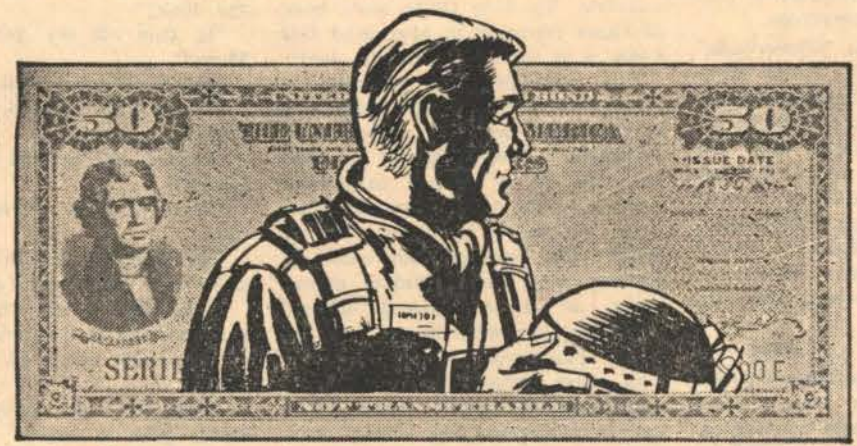
It takes money to keep our jet pilots patrolling the skies. . . .