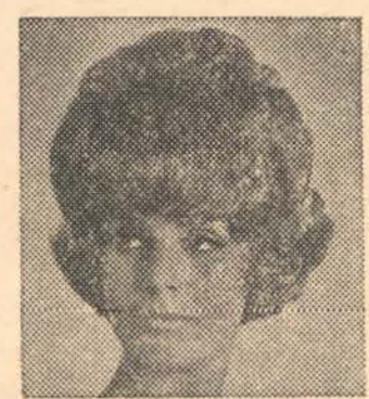
Miss Norma - Miss Edith to serve you.

Next to Greenbelt Theatre - Greenbelt Shopping Center