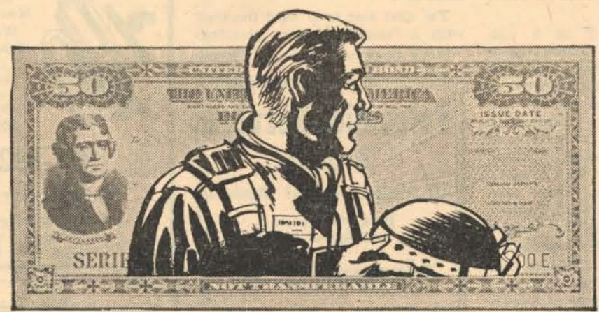
It takes money to keep our jet pilots patrolling the skies. . . .