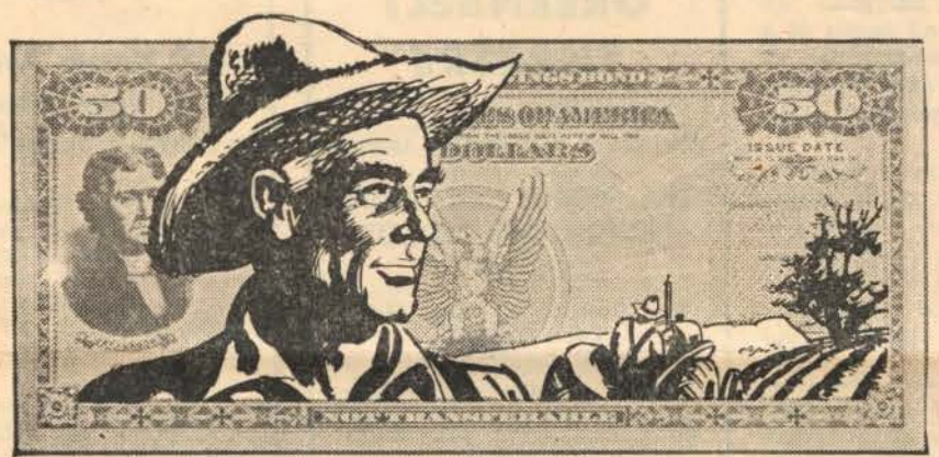
Money to insure that our productive power will thrive. . . .