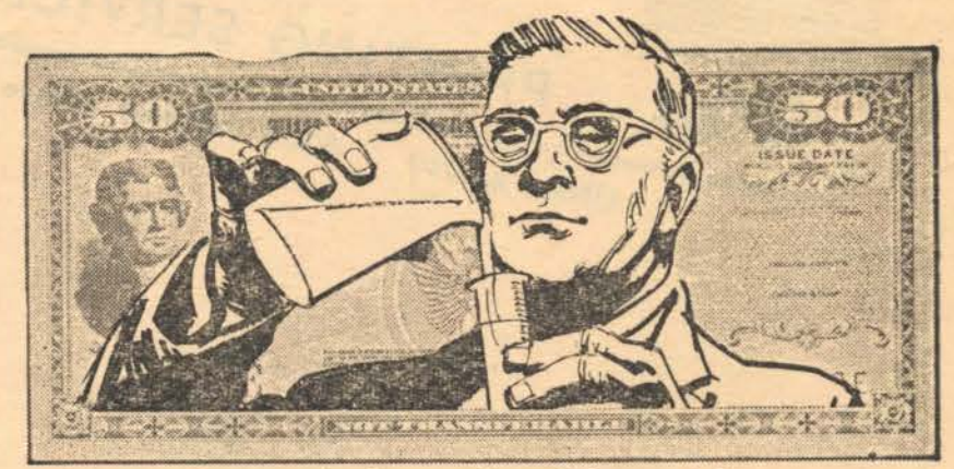
Money to let our scientists continue their search for answers....