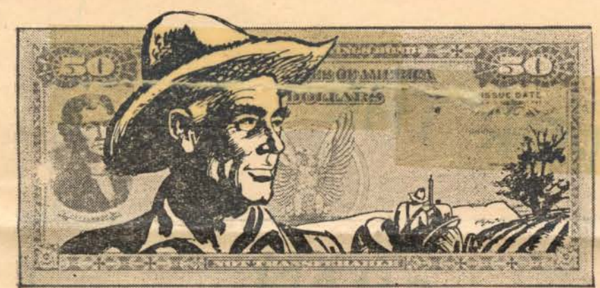
Money to insure that our productive power will thrive. . . .