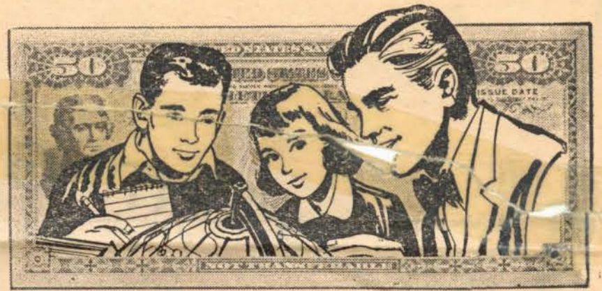
Money to help our children learn how to make peace lasting.

Yes, peace costs money. Money for research and schools and military preparedness. Money saved by you to keep our economy strong