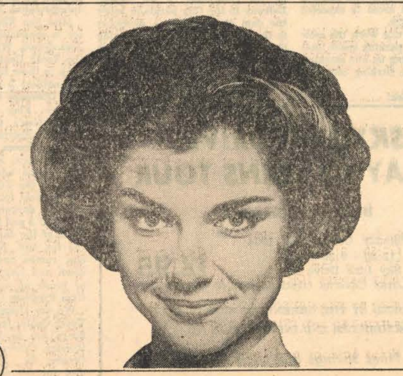
If the girl in your life is an angel...