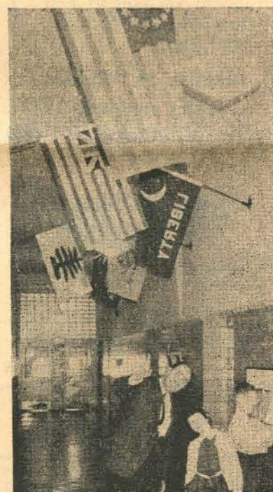
points some of the special revolutionary flags made for the New Heritage Hall in the Center School.