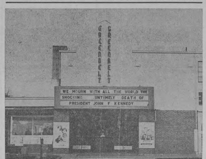
The Greenbelt Theatre expressed the feelings of the entire community