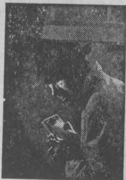
U.S. Savings Bonds are theft-proof! Fire-proof and loss-proof, too. Since 1941 the Treasury Department has replaced almost 1½ million Bonds at no cost to the owners.