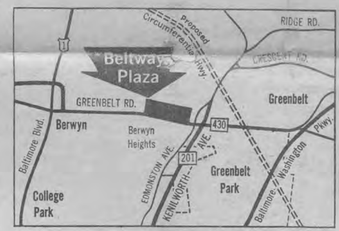
Map pinpoints location of new shopping center.

City Manager Charles McDonald, commenting upon the new proposal, pointed out that it would result, within the next two years, in a 50% increase in the present base, or an increase of $4 1/2