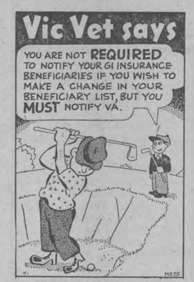
For full information contact your neare VETERANS ADMINISTRATION office