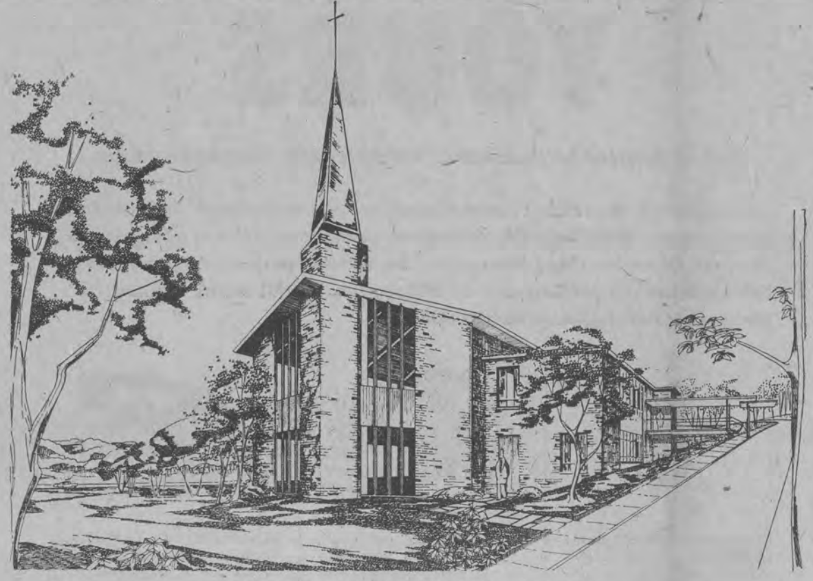
Proposed Greenbelt Bapt st Chapel - First Unit

Greenbelt, Maryland, Thursday, October 18, 1956