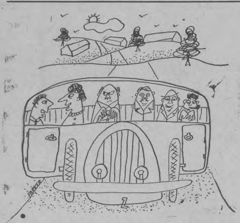
"In Greenbelt things are different . . . . everyone wants to be a front seat driver!"