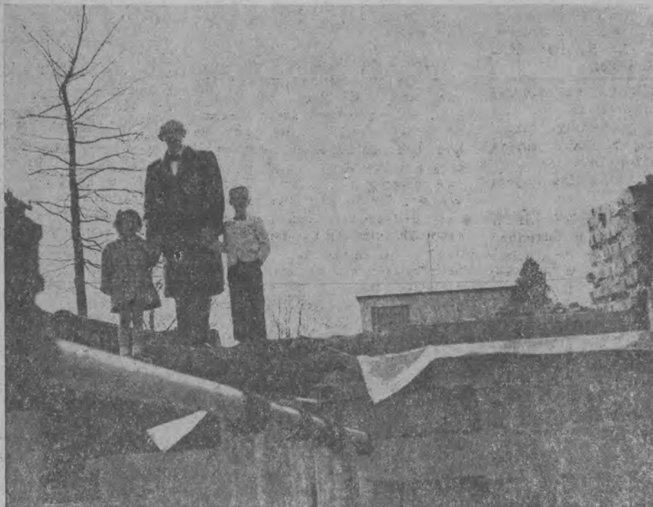
(RECENT PHOTO OF OUR BUILDING SITE - 40 RIDGE ROAD)